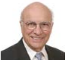
Clayton Keith "Clay" Yeutter 23 rd United States Secretary of Agriculture

Clayton Yeutter (December 10, 1930 – March 4, 2017) is one of four Nebraskans who served as United States Secretary of Agriculture. Yeutter served under George H. W. Bush from 1989 to 1991, developing the 1990 Farm Bill (the Food, Agriculture, Conservation, and Trade Act of 1990).